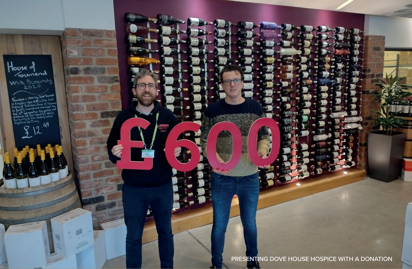
PRESENTING DOVE HOUSE HOSPICE WITH A DONATION